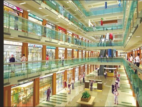
Artistic View of Inside Mall